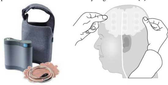
FIGURE 1: Left, Field generator and arrays. Right, arrays placement on scalp.

Diffuse midline glioma, H3K27M, WHO grade IV, is a rare tumor, mainly in children and adolescents. The prognosis in adults may be slightly better than in children, but it is more aggressive and treatment-resistant than glioblastoma [1-3]. According to WHO (World Health Organization) classification, midline glioma has its own tumor entity [4, 5]; the tumor growth is diffuse and infiltrates the midline and brainstem and has the characteristic mutation H3K27M [5]. There is no established consensus of therapy for these patients. In Sweden, it is practice that the patients are treated in the same way as glioblastoma [6].