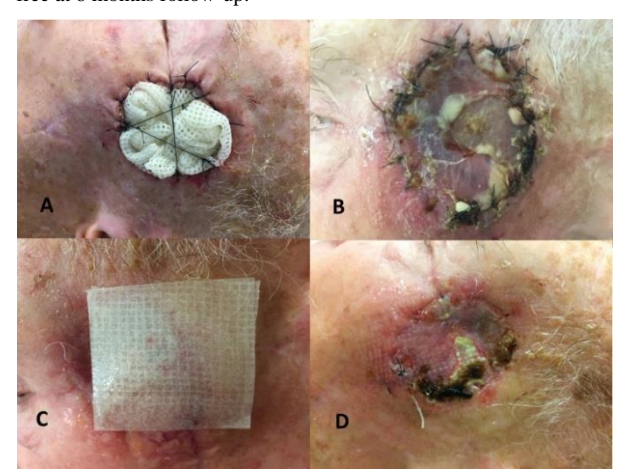
FIGURE 2: A) Skin graft recipient site with Jelonet® bolster pressure dressing. B) Skin graft recipient site at time of bolster removal on postoperative day 7. Small area of graft necrosis is visible. C) Honey-impregnated dressings for local wound care. D) Graft appearance with persistent area of graft necrosis.

American Journal of Surgery Case Reports doi:10.31487/nl.AJSCR.2020.01.01