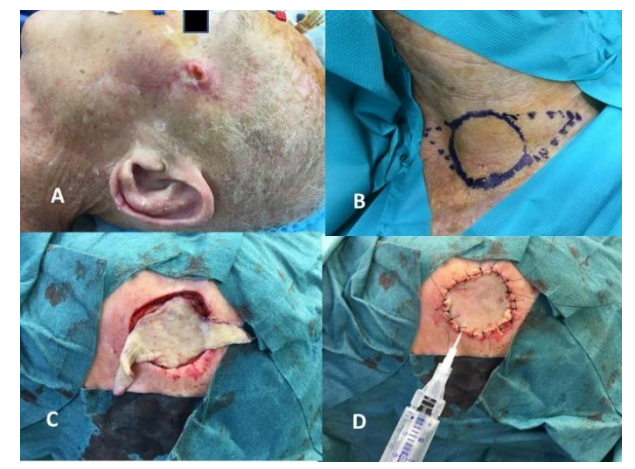
FIGURE 1: A) Preoperative appearance 2.5 cm ulcerated mass overlying the left zygomatic arch. B) Skin graft donor harvest site from contralateral low neck. C) Skin graft positioned over defect after resection with oncologic margins. D) Biologic fibrin tissue glue applied between the suture line at skin graft recipient site.

Mr. A, aged 85 years, presented with a two-month history of a cutaneous mass adjacent to the left zygomatic arch (Figure 1A). An initial biopsy suggested a histologic diagnosis of atypical fibroxanthoma. The patient's medical history also included: an ipsilateral parotid adenoid cystic carcinoma treated 9 years prior by a facial nerve-sparing parotidectomy and ipsilateral II-III neck dissection complicated by a local recurrence after 13 months treated by surgical resection and 65 Gray adjuvant radiation therapy; prostate adenocarcinoma treated by radiation therapy 24 months prior to presentation; and, high blood pressure. Physical examination revealed an isolated ulcerated temporal skin lesion, (Figure 1A) mobile, without facial nerve palsy or palpable head and neck lymphadenopathy. The tumor measure 25 mm in diameter on MRI, without evidence of underlying muscular or bony infiltration. No pathologic lymphadenopathy was seen, nor evidence of recurrence of the adenoid cystic carcinoma at the ipsilateral parotid.